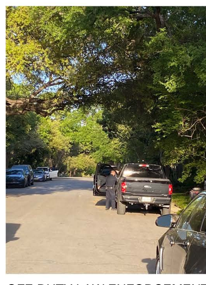
OFF-DUTY LAW ENFORCEMENT PARKED IN 'NO PARKING ZONE'