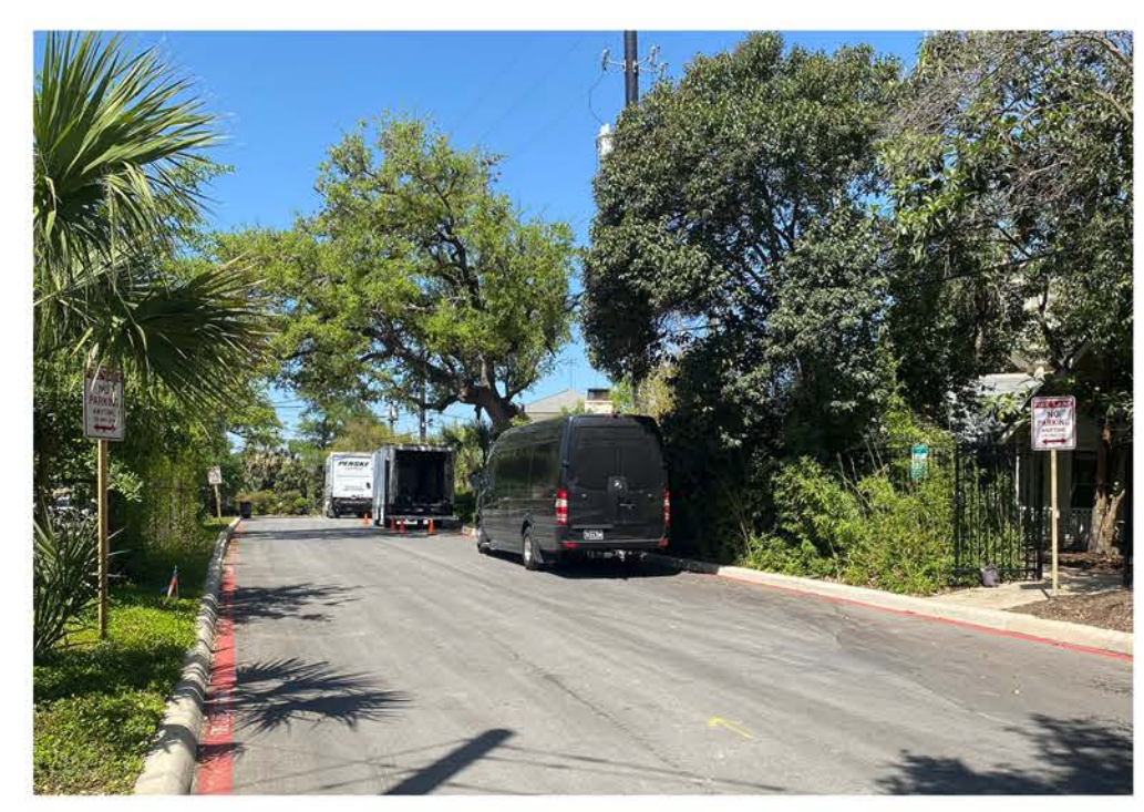
EVENT SERVICE VEHICLES PARKED IN FIRE LANE / NO PARKING AT ANY TIME