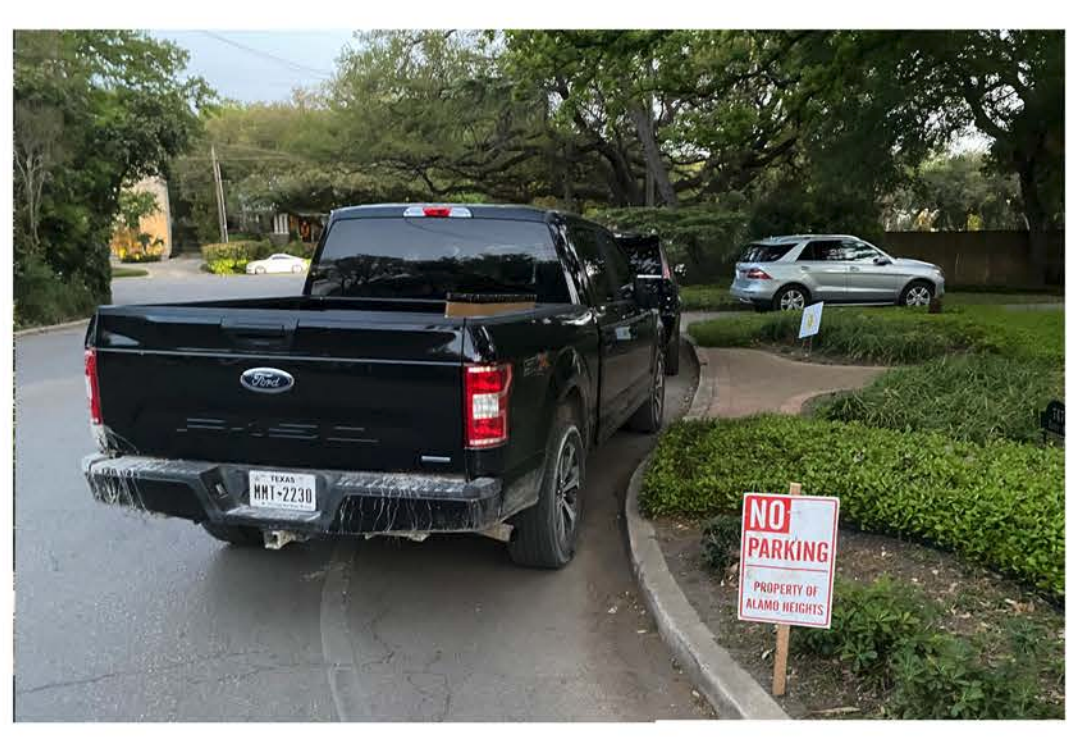
PARKED IN 'NO PARKING ZONE'