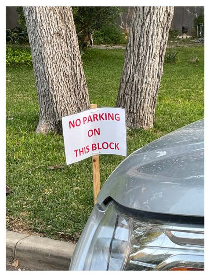
PARKED IN 'NO PARKING ZONE'