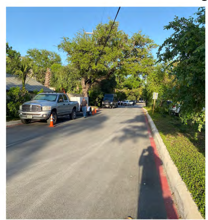
EVENT SERVICE VEHICLES PARKED IN FIRE LANE / NO PARKING AT ANY TIME