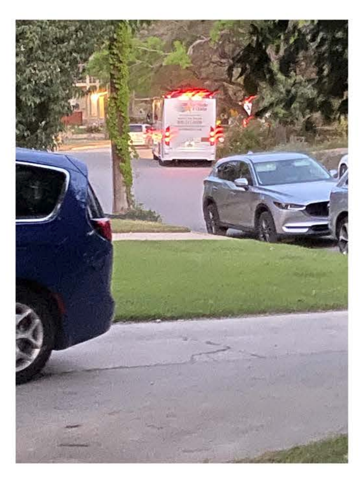
BUS PARKED AND IDLING IN 'NO PARKING ZONE'