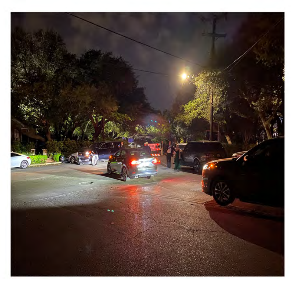
RIDE SHARE CONGESTION