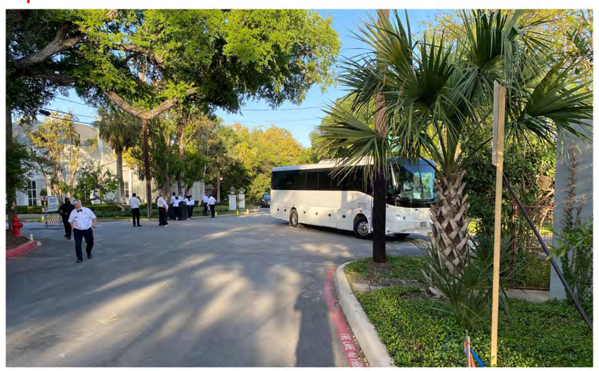
VALET STAND | LG SHUTTLE OFF-LOAD | SHUTTLE TURNING ONTO TORCIDO