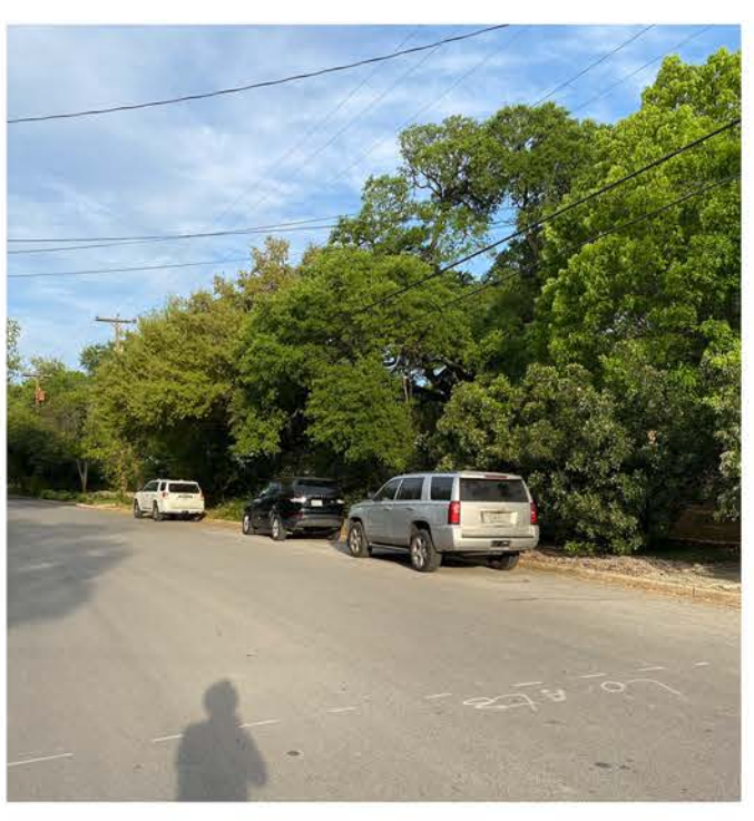
EVENT GUESTS PARKED IN 'NO PARKING ZONE' ... SUNDAY MORNING