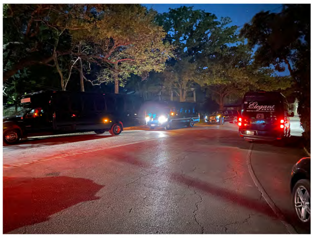
SHUTTLE BUSES PARKED AND IDLING AT ESTES & PATTERSON