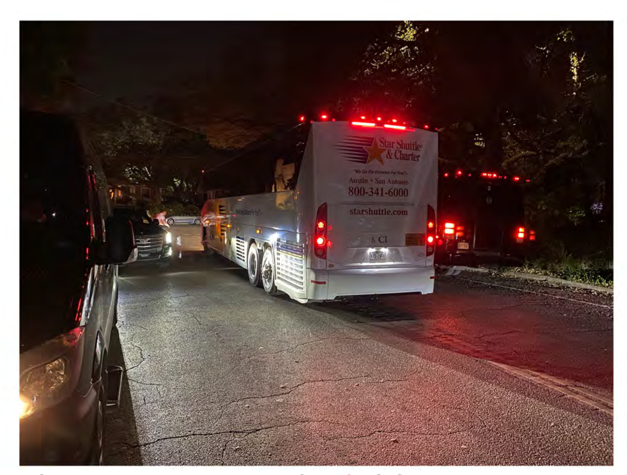
RIDE SHARE PARKED IN 'NP' ZONE | LG SHUTTLE PARKED MID STREET | SHUTTLE BUS PARKED IN 'NP' ZONE + STOPPED TRAFFIC